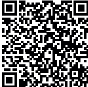
Visit our product page